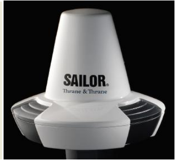
TT-3027 (not affected)